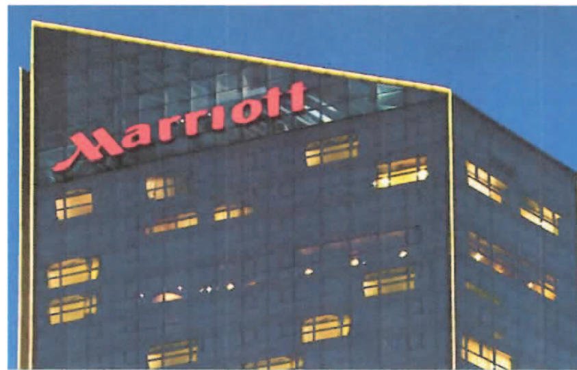
JW Marriott Beijing

Standard room: 1050 rmb per a night, include free breakfast and WIFI